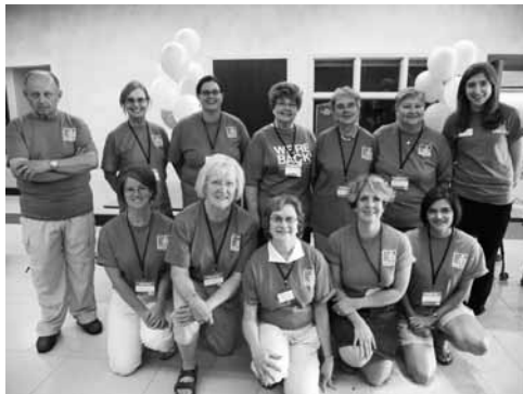
The Friends of Franklin Avenue Library Served Cookies and Lemonade.

More than 500 customers of the Franklin Avenue Library walked, biked, and drove to be a part of its long-anticipated reopening held on Sunday, August 21. Anticipated to be the first LEED Platinum-certified library in Iowa, the library celebrated its new fresh look on Sunday, August 21. This $8.4 million renovation is latest project in the Des Moines Public Library's system-wide $48 million capital campaign that included a new Central Library and renovations at all five of its branches.