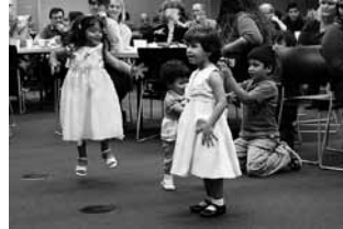
The children loved the chance to dance.