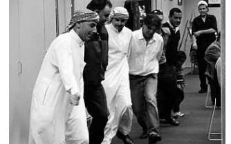
Participants performed a circle dance around the Central Library meeting rooms.