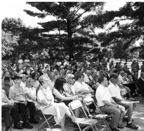
Hundreds gathered outside the Franklin Avenue Library for its grand reopening on Sunday, August 21, 2011.